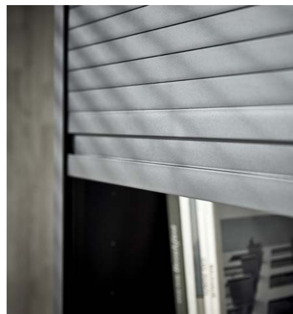
A matt look from every angle

Storage solutions to suit every taste, without compromising on functionality – that's the aim of our 'The art of storage' collection. Whether it's noble matt, glass-effect or metal tambour doors or a FLIPDOOR system – you can decide which cabinet is right for you. Matching surfaces and edgebands complete the look.