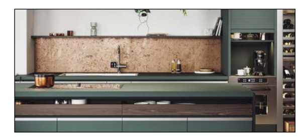
Fig. 02-3 RAUVISIO noir worktop

The RAUVISIO noir worktop is available as laminated board made of a HPL (High Pressure Laminate) board of a chipboard at the core and a suitable HPL balancing sheet or a brown cost-effective back-pull foil. The standard dimension comes to 1,300 x 4,100 mm. This is available with a core of 38 mm.