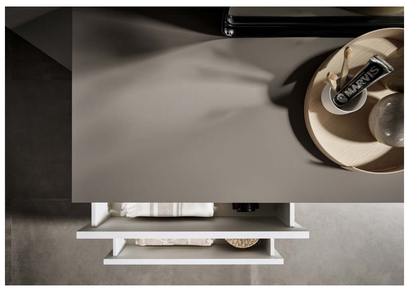
Fig. 02-1 RAUVISIO noir in use